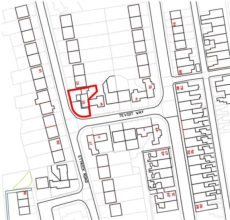
Existing Site Plan (1:1250)

For further details of existing boundary features, refer to notes on Drawing No, PL04.